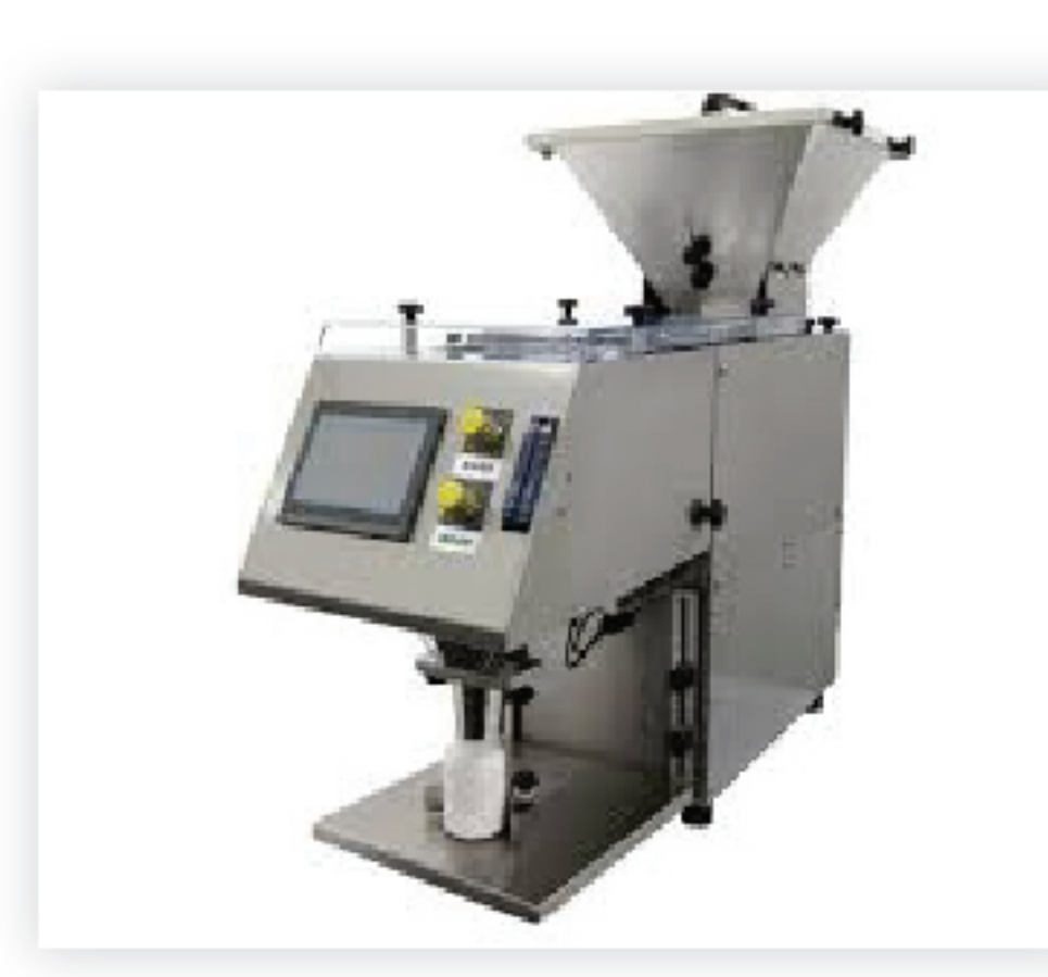
Desktop table counter